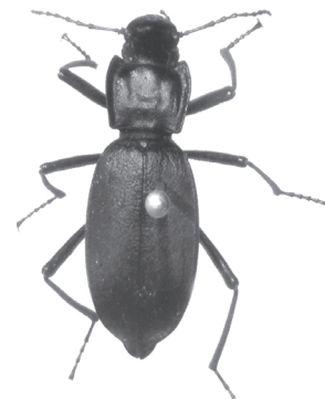
Figure 8: Cyphogenia sp.