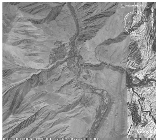
Figure 1b: Satellite view of area of study

spots one being on the suture therefore 1½ on each elytron towards the posterior end. Abdomen black. Legs almost similar in shape, tarsi 5-5-5.