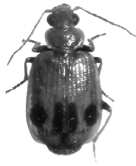
Figure 2 and 3: Amara sp.; Lebia spp.