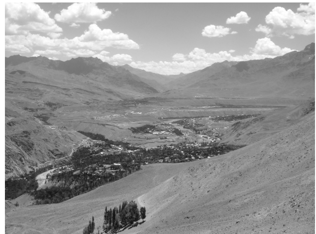
Figure 1a: Panoramic view of Area of Study

Diagnostic features: Elongated, dorso-ventrally flattened, reddish brown, shining thorax with black abdomen except for the pro-thoracic sternum. Head with prominent bulged eyes. Antenna filiform and 10 segmented. Mouth parts biting and chewing, mandibles large, sharp and curved. Pronotum heart shaped. Elytra short, pygidium visible, three prominent