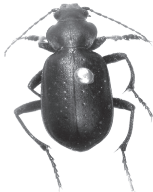
Figure 4 and 5: Bembidion spp.; Calosoma sp.